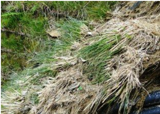
Foto 30 Abundance of roots