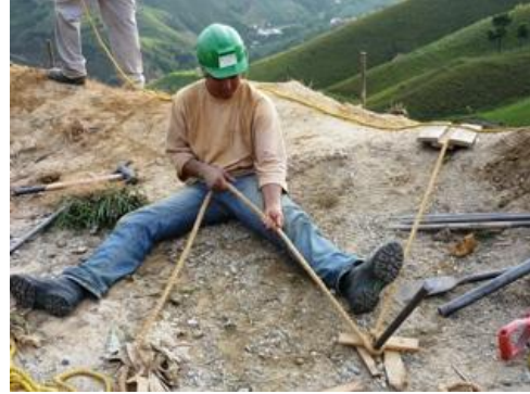
Photo 12 Securing the fall of a worker

After completing the reprofiling work, the excess of soil material that was in the bed of the gully was removed. To accomplish this, a method that consists of projecting a jet of water under high pressure was used, which remove large masses of earth, while the one settled in bed was compacted.