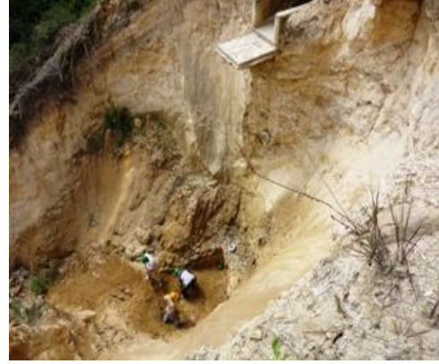
Photos 5 and 6: The depth reached by the gully. The size of the people serves as a reference (Aug. 2009)

Erosion caused a difference in height of 4.2 meters in just 3 years of monitoring, as shown in the curves of Figure 1, while on the slopes outlined irregular shapes that became in some cases vertical. Some areas showed fractured soil blocks.