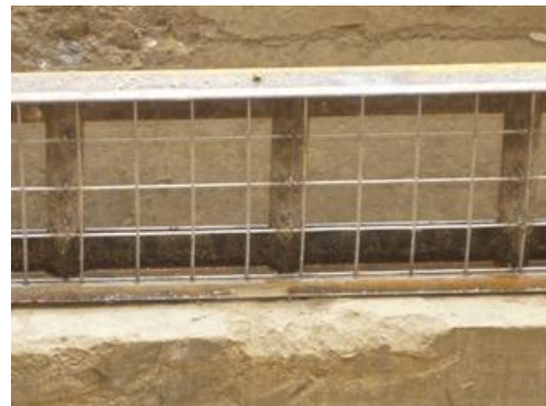
Photo 8 Detail Grid

The tanquillas are connected to a battery of 16 4-inch HDPE pipes; they lead the water to the disposal site (Photos 9 and 10).