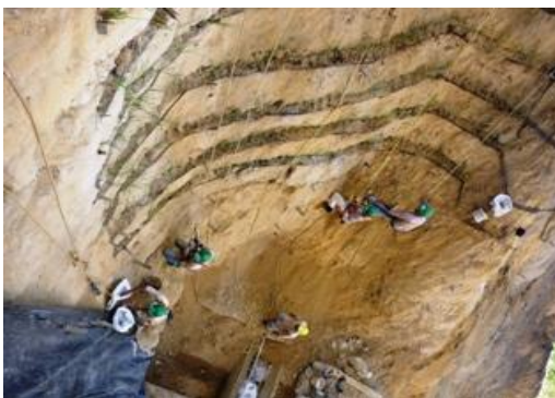
Photo 13 Planting in horizontal stripes