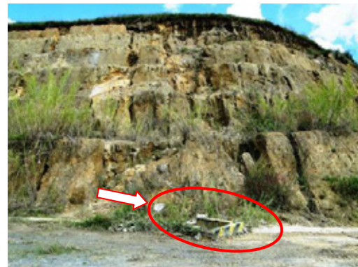
Foto 18: Slope that provides the gully sediment Arrow: direction of flow. Circle: Capture Tanquilla