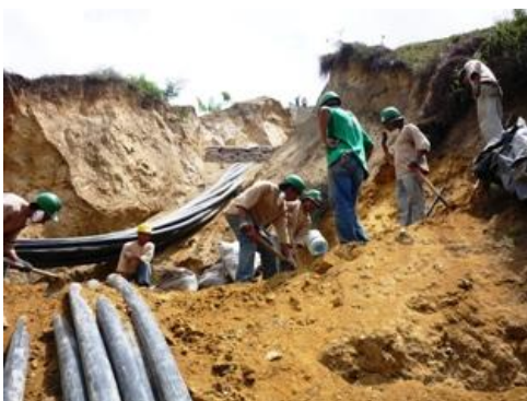
Photo 9 Piping system

The tanquillas are connected to a battery of 16 4-inch HDPE pipes; they lead the water to the disposal site (Photos 9 and 10).