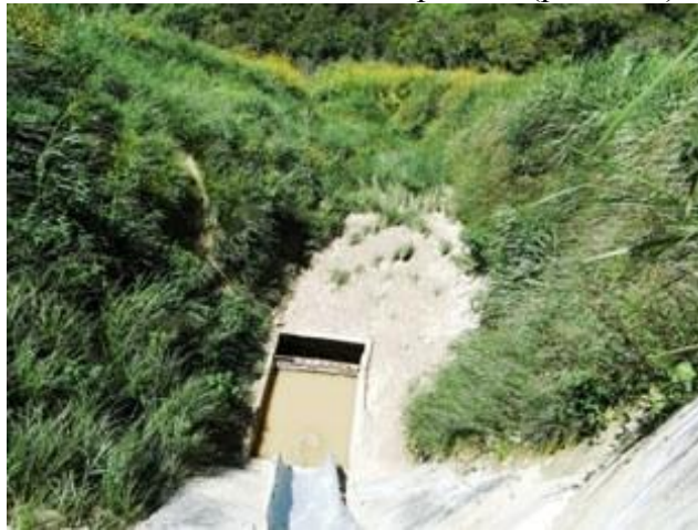
Photo 23. State of the gully in October 2010.

All the gully was stabilized in less than 1 year, despite disturbing elements of the system were observed during monitoring. In view of this, recommendations were made to remove excess sediment and eliminate weeds present (photo 23).