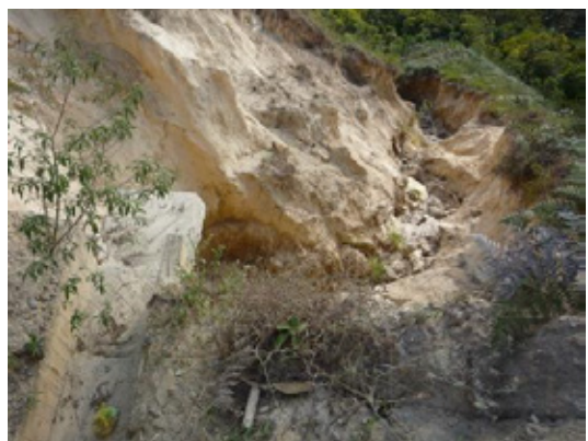
Photos 3 y 4 State of the gully in May 2009, before applying VS

The soils of the area where the gully is located are sandy loam, containing 65% sand, 29% silt and 6% clay. The soil erodibility caused the gully to progress from 6.00 meters to 10.2 meters (pictures 5 and 6).