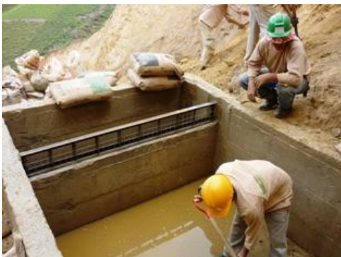
Photo 7 Receiving Tanquilla

The receiving tanquillas has a grid to prevent objects larger than the diameter of the hoses to pass into and obstruct them. (Photos 7 and 8).