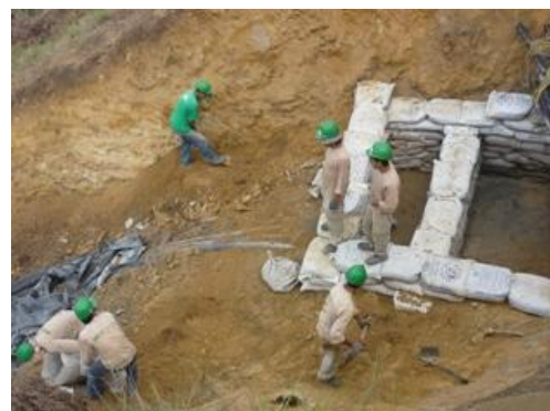
Photo 10 Transition Tanquilla and hoses