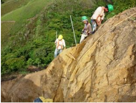
Photo 11 Start the reprofiling

Staff hired for these tasks are members of the environmental group and rescue "Condor", all residents in the town of San Pedro de los Altos, near the site of the gully.