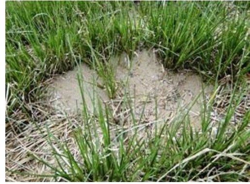
Photos 21 and 22 sediment trapped by the barriers placed in the bed of the gully (May 2010)

All the gully was stabilized in less than 1 year, despite disturbing elements of the system were observed during monitoring. In view of this, recommendations were made to remove excess sediment and eliminate weeds present (photo 23).