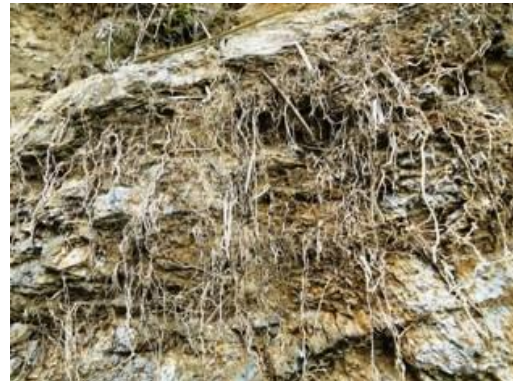
Foto 31 Roots anchored in shale