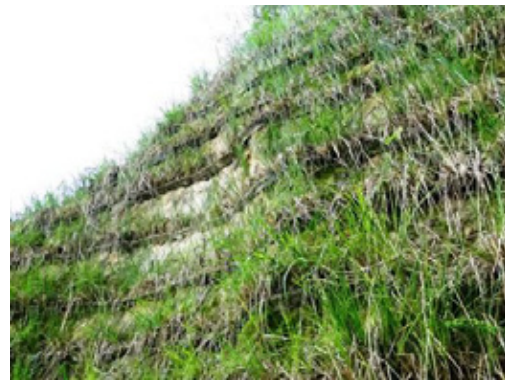
Photo: 27 barriers were not damaged slopes