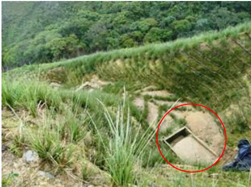
Foto 17: Sand deposited in the recipient tanquilla. vetiver barriers are seen covered (October 2010)

significantly increased the sediment supply to the gully. From the second week of May 2011 the system collapsed.